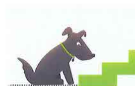
Difficulty with stairs

1. Do you think your dog shows signs of pain?