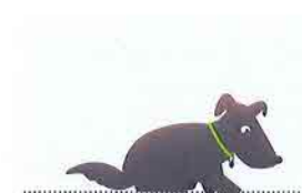
Slow to rise