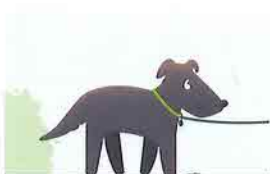
Lagging behind on walks