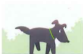
Limping after exercise

Think about your dog's activity in the past week. Check all of the signs that you've observed in your dog.